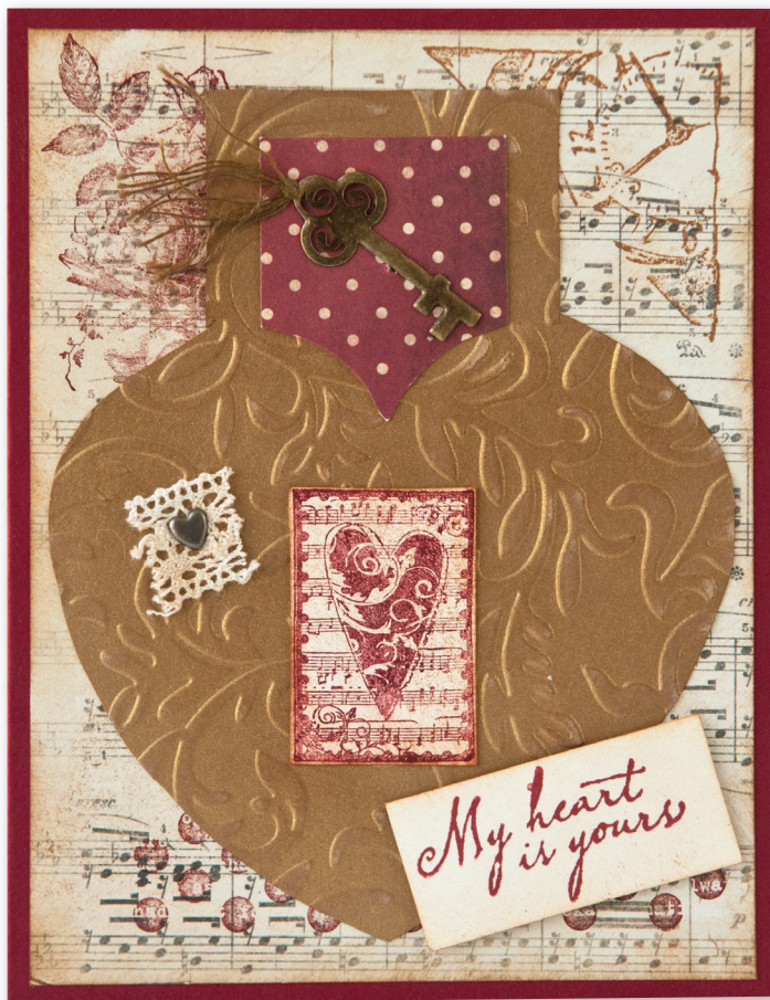
My Heart is Yours • 4¼" x 5½"