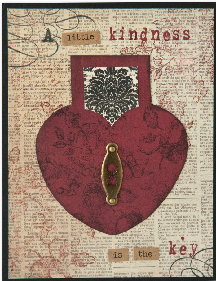
A Little Kindness is Key • 4¼" x 5½"

Supplies Stamps: (Stampendous). Paper: (Graphic 45)