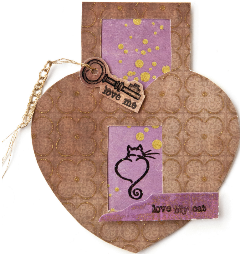
Unlock & Make Amazing Things Happen • 4" x 4 3/4" Karen Seifert • Mt. Juliet, TN

Computer-generate heart locket onto magazine page, cut out panel, paper-punch corners, wrap with twine, and adhere to card. Adhere key to card. Stamp words onto card. Computer-generate magazine and keyhole, cut out, and adhere to card. Stamp words onto patterned paper, cut out, and adhere to card. Adhere letter stickers to card.