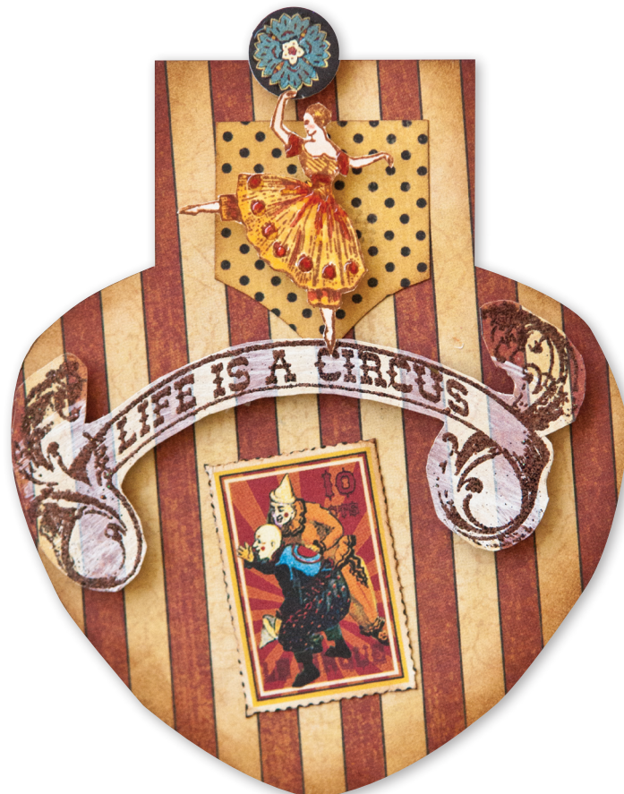
Life is a Circus • 4" x 4¾"

Supplies Stamps: (Stampin' Up!); (Studio G). Ink: (Stampin' Up!). Paper: (My Mind's Eye); (Stampin' Up!). Accents: lace (Stampin' Up!); embossing folder (Cricut - Cuttlebug); brad, key (Recollections)